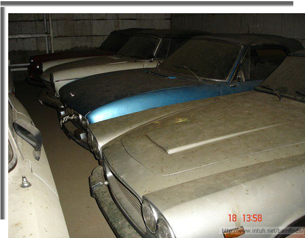
Lancia Flaminia Coupé, Peugeot 504 cabriolet & 404 cabriolet.