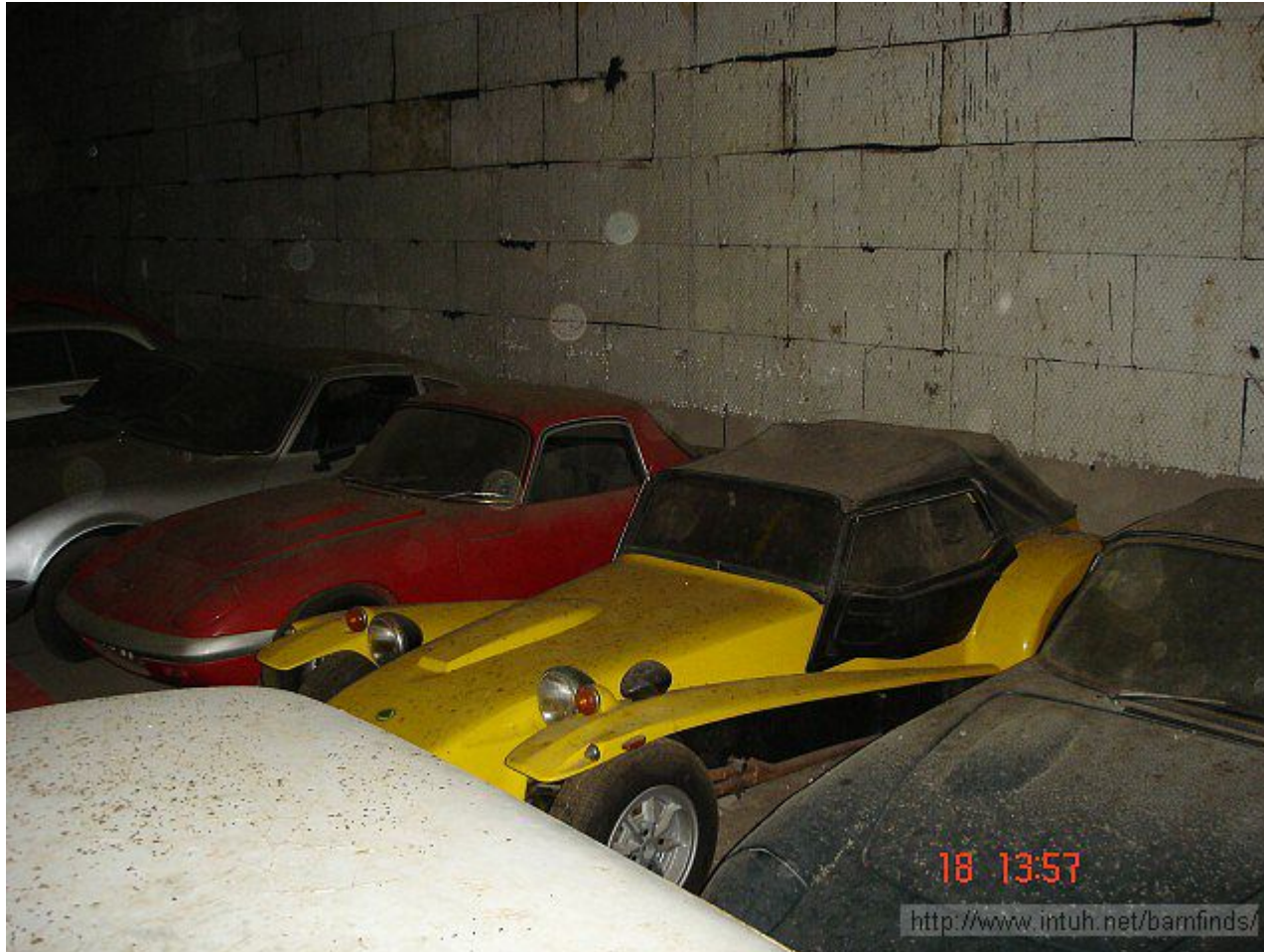
Opel GT, Lotus Elan FHC, Lotus Super Seven Series IV, Lotus Elan DHC.