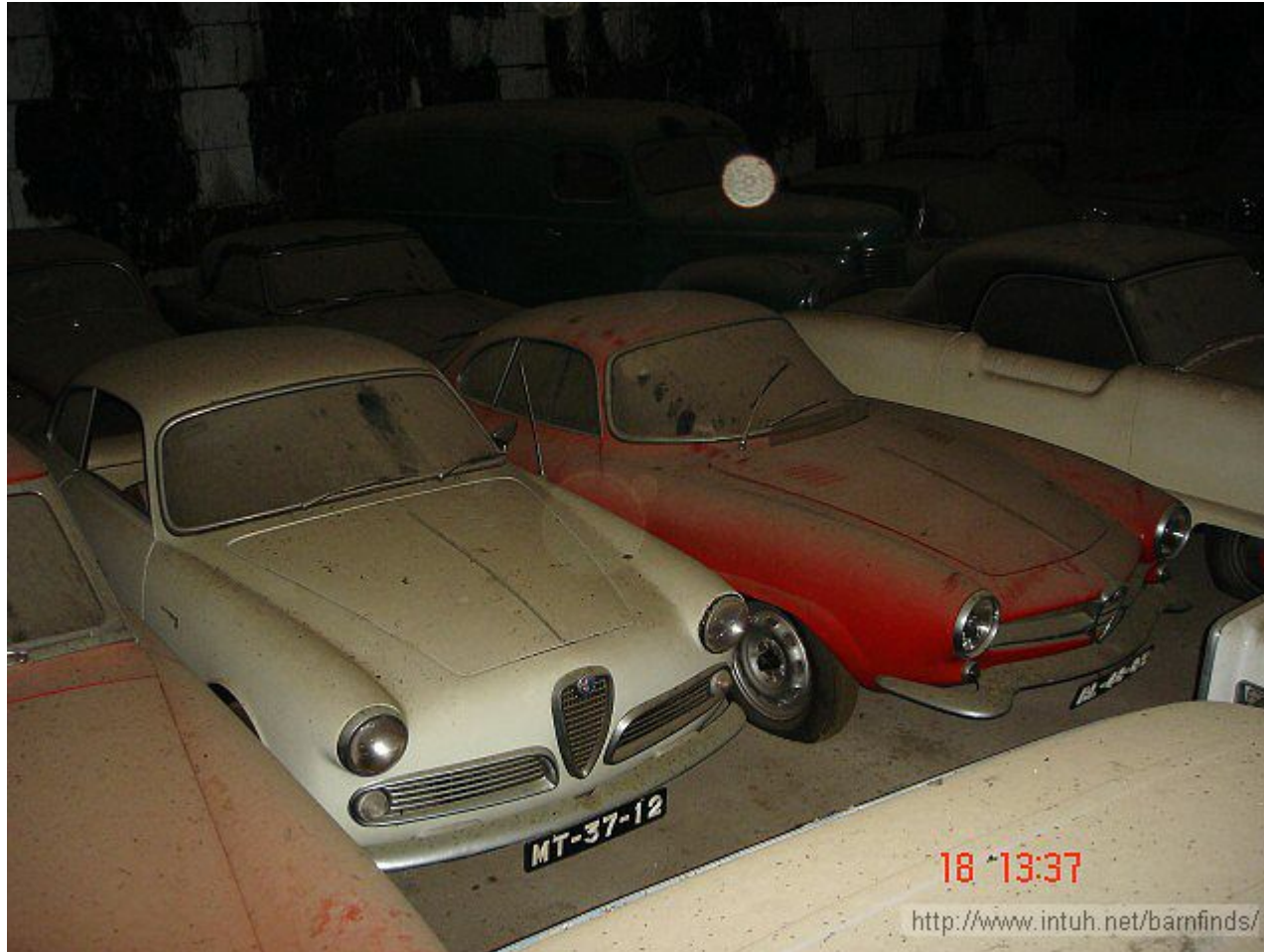
Giulietta Sprint, Giulia Sprint Speciale (SS), Nash Metropolitan.