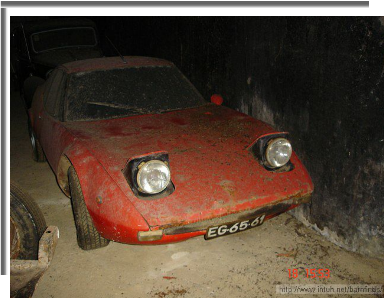
Abarth 1300 Scorpione.