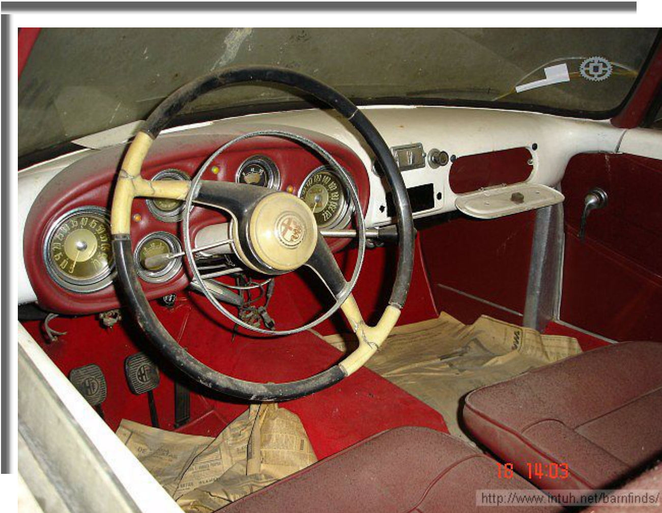
Interior of Alfa Romeo.