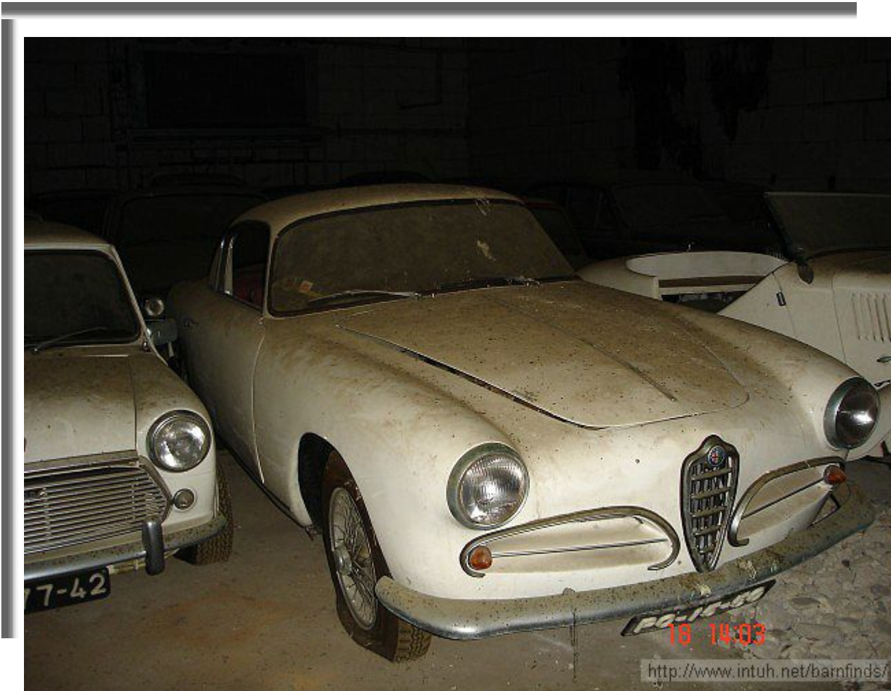
Mini, Alfa 1900 Super Sprint, Balilla.