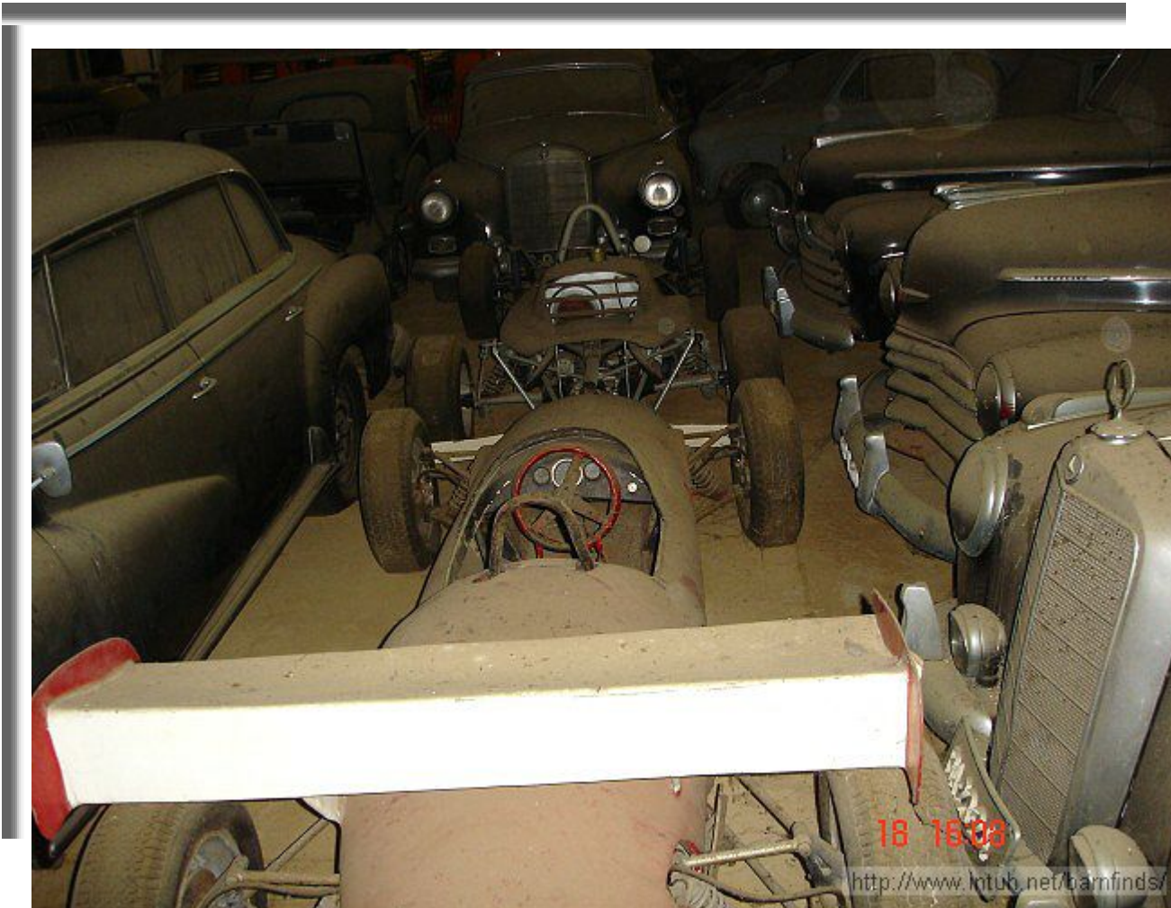
BMW V8, Formula racers, Chryslers, Mercedes, Austin A30.