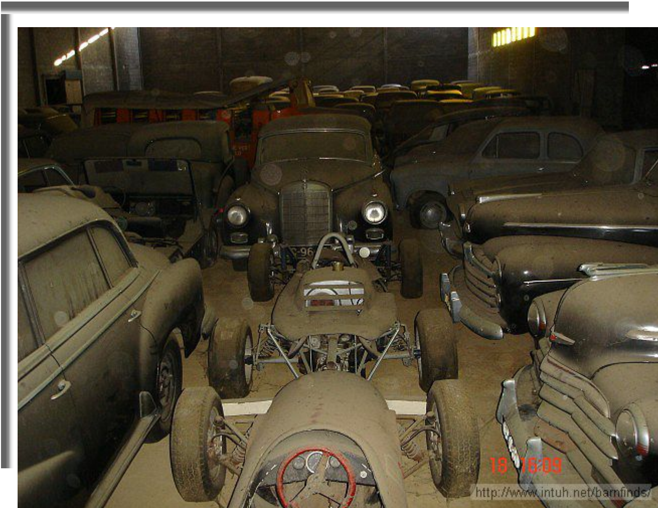
BMW V8, Formula racers, Chryslers, Mercedes, Austin A30.