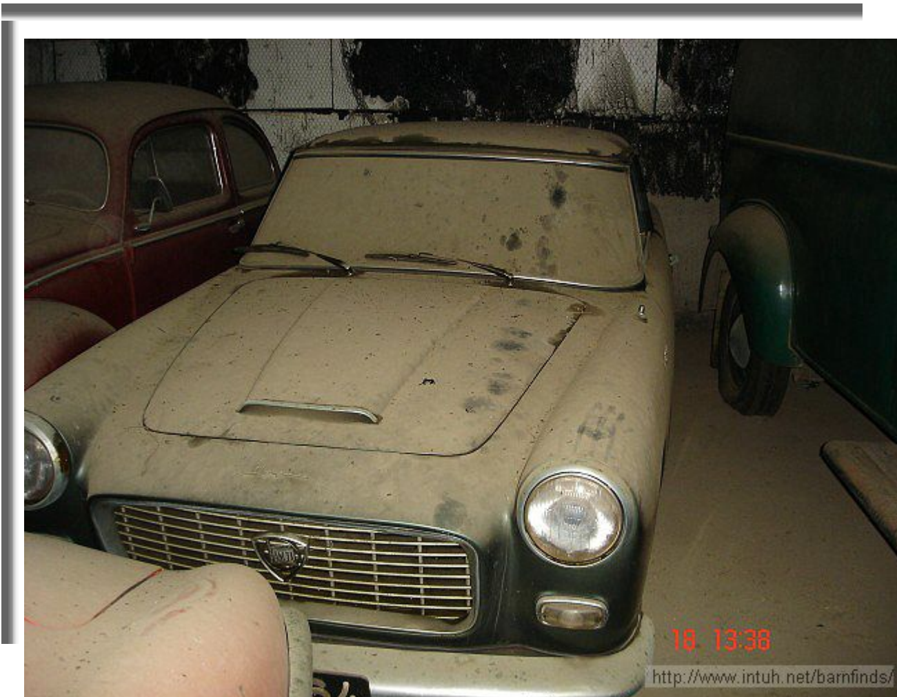
Lancia Flaminia Coupé.